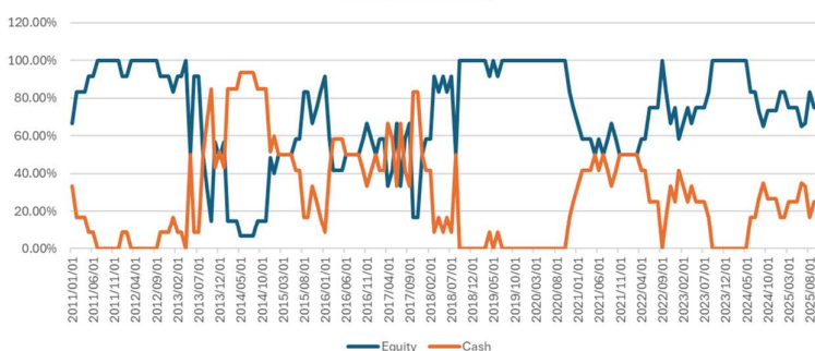
Risk on vs Risk Off